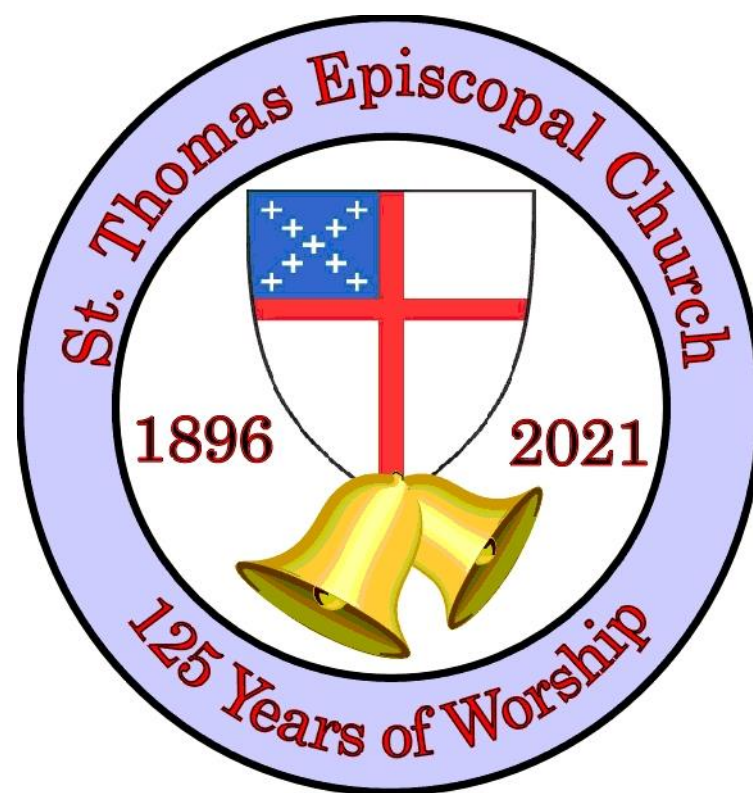
Saint Thomas' 125 th Anniversary Logo