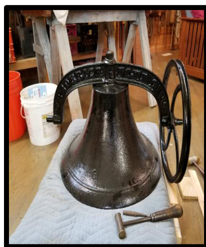
The bell, which will soon ring in St. Thomas' memorial garden.